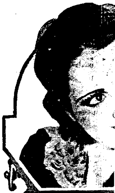
Billie Dove, in "The Other Tomo Monday, Tuesday and We